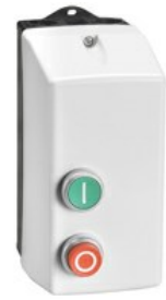
Direct-on-line starter M1P00912...A9